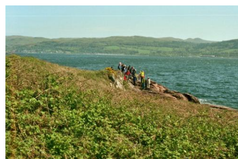
2. The group below Lion Rock

On our way to our next location, we passed the Marine Biology Station, at “De’il’s Dyke”, another Tertiary intrusion (location2a on the map). This also stands proud of the eroded Old Red Sandstone and the associated raised beach.