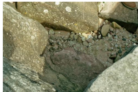
4. Caliche at Kaim Bay

Caliche, sometimes called “calcrete”, consists mostly of calcium carbonate, with minor additions of other elements such as magnesium and iron. The marls beneath the sandstones are made of coarse grained red siltstone, in which calcite “partings” and green reduction spots are evident. The few pebbles in the marls are concentrated into thin horizons. These two features show periodic rapid flooding followed by arid conditions, such as is found in present day wadis and sabkhas.