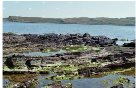
12. Basin seen from a high vantage point

Much discussion ensued about the nature and cause of the large sandstone mass, the disappearance of the tholeiite dyke, and the basin formation.