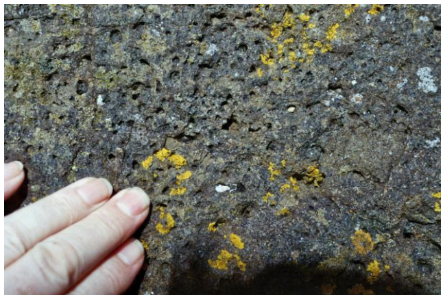
8. Vesicles in the N-S Dyke

the direction of the tholeiite dyke points towards the southern tip of Arran, where a sill is thought to have been the source of the dyke. At several places, vesicles were present in the tholeiite dyke (photo 8). This suggests a near surface intrusion of the magma. It is possible that this dyke is a late Carboniferous quartz-dolerite like that at Millburn (reference 6, p.34).