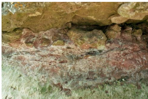
3. Caliche formations at Kaim Bay

The junction between the marls and the sandstones was of particular interest. The abrupt change may have been caused by uplift of the source of the sandstone, or the braiding of the rivers which supplied the sediment. The pebbles at the interface, and the irregular nature of that interface, indicate a fast flowing high energy environment. Caliche formations (photos 3 and 4) are indicative of periodic flooding followed by percolation and subsequent precipitation by evaporation.