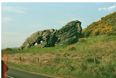
1. Lion Rock

Our first stopping point was Lion Rock (location 2 on the map, photographs 1 and 2). This is one of the Tertiary dykes. It consists of Labradorite with anorthite feldspar crystals (reference 5, p.36). The exposure of the dyke above the surrounding landscape is due to erosion in past times, when the sea level was 10 m higher than it is at present. (photo 1). The raised beach and former cliff line, which is the result of isostatic rebound of the land after disappearance of the ice 8000 years ago, is well displayed in the vicinity of Lion Rock. Below Lion Rock, the Upper Old Red Sandstone was exposed. Here, it was possible to observe the crossed bedding and pebble clusters typical of high energy, fast flowing, intermittent flooding. The redness of the rocks indicates a sub aerial environment in which the iron content was well oxidised. In some places, yellow joints indicated partial hydration and reduction of some of the iron. The group examined these features (photo 2).