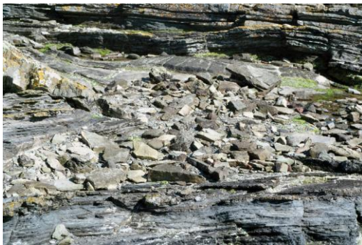
11. The Basin Structure

The whole structure (photographs 11 and 12) at the south end of the tholeiite dyke appears to be a small basin into which sediment has accumulated, with the characteristic thinning towards the edge of the basin.