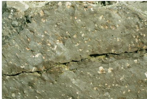
5. Cumbraeite at Eerie Port

It is of Tertiary age. The jointing which is caused by rapid cooling, and the glassy nature of the ground mass of the dyke, shows near surface emplacement of the lava. The bleach zone in the surrounding Old Red Sandstone Strata is narrow, and is of low metamorphic grade.