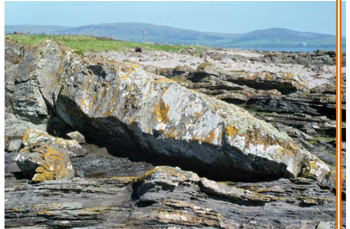
10. The Slumped Sandstone

About 100 metres north of the Telephone cable Marker post, the dyke appears to come to an end, and the strike of the marl/sandstone beds swings round from a north-west strike to a south-west strike. Also, a large, apparently slumped, massive yellow sandstone appears, with a north-west strike and 45 degree dip to the south-west (photo 10).