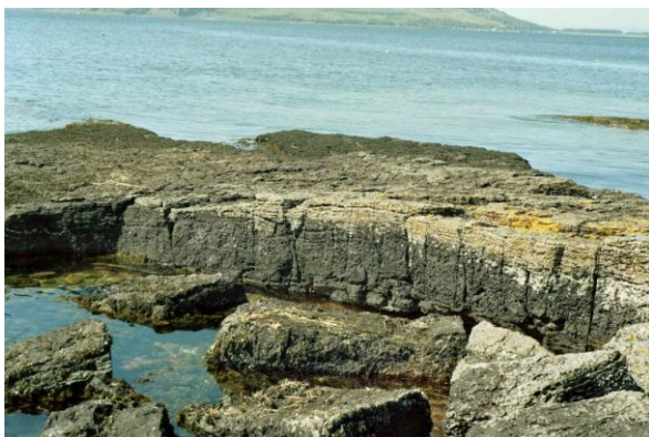
South of Westbourne Cove, the first item of interest was the stromatolite bed.

At the cove at Westbourne, the raised beach and the old cliff line are plainly visible. In several places, where human or animal activity has disturbed the ground, the shell beds are visible. These formed a shallow water area just below the old cliff line, before isostatic rebound caused uplift and formed dry land. Many of the shells are of present day species. A few indicate a short period when the sea was one or two degrees warmer than at present. Others are of a sub-Arctic species long departed from our shores (reference 5, pp. 48, 79 to 80).